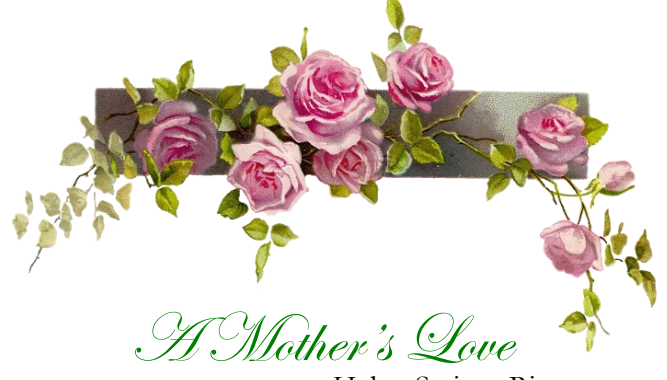
~ Helen Steiner Rice~